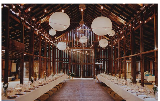
Old Barn Event Center - 2016

The Old Barn was converted to an event center for weddings, dinners, wine events, etc. along with the exterior improvements that took place in the Barn & Silo improvements above.