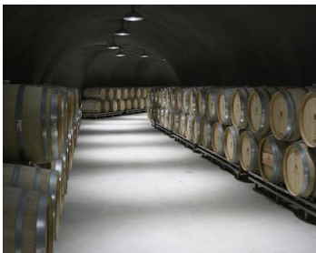
Halter Winery Production Facility & Barrel Caves-2011

MWA acted as owners representative for design build team. Barrel caves were completed in 2013