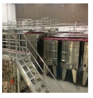
Private Tasting Rooms & Production Facility Improvements – 2015

Parallel to the development of the Tolosa terrace, we worked with production staff to create a brand new barrel tasting experience, install state of the art equipment (open top tanks, barrel warming rooms, and a brand new glycol cooling plant).