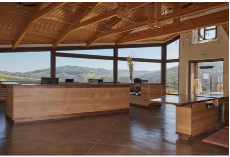
Hospitality Center – 2015

The addition of a new 6,000 sf. Tasting facility and patio addition completed the Owner's original vision of a state-of-the-art wine making and tasting campus. This tasting facility serves as the gem of the campus and provides visitors with sweeping views of the surrounding vineyards.